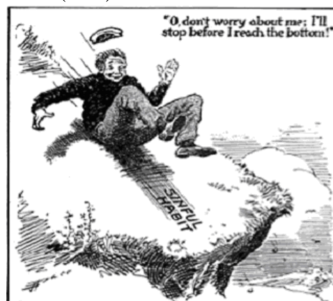
Repent today, tomorrow might be late. The Lord is coming soon.

May the God of peace, who through the blood of the eternal covenant brought back from the dead our Lord Jesus, that great Shepherd of the sheep, equip you with everything good for doing His will, and may He work in us what is pleasing to him, through Jesus Christ, to whom be glory for ever and ever. Amen. Heb 13:20-21(NIV)